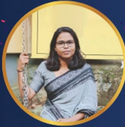
SUMI V T PHYSICAL SCIENCE

Conducted by Sree Narayana Training College, Nedunganda